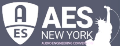
Exhibit pricing & information